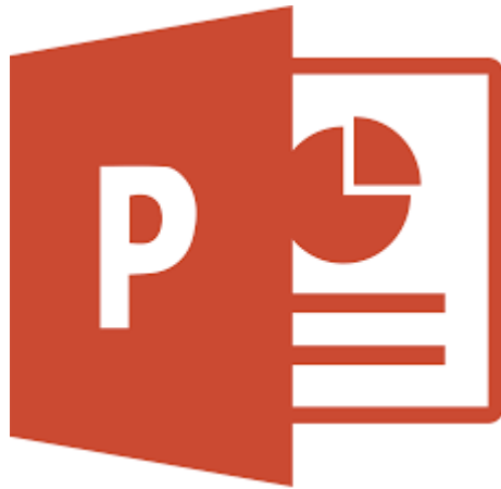
Raw content on PowerPoint

How do we ensure content offered up is valid and kept current?