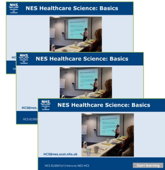
Approval and hosting of module on TURAS Learn